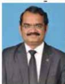
Dr. M. Annadurai